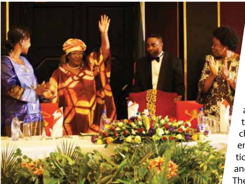
Malawi conference with Pres. Joyce Banda

Since 2009 FEMNET has convened Annual Regional Conferences on African Women in Political Leadership. The purpose of these conferences is for African women leaders, in politics and in the women's movement, to share experiences and collectively devise ways to overcome the persistent challenges that hinder women's equal and effective participation in political leadership and decision making processes. The Fourth Regional Conference on African Women in Political Leadership with the theme Inter-