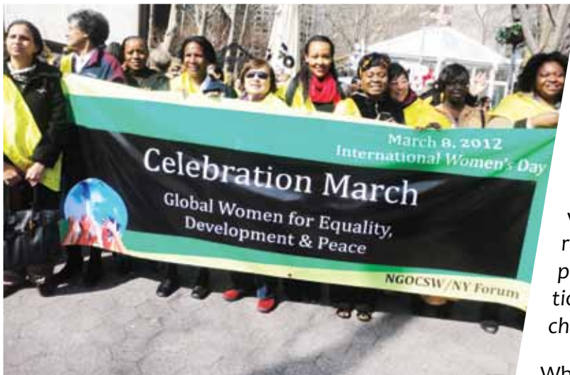
FEMNET @ UN-CSW in New York