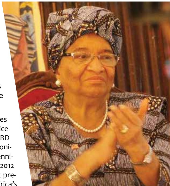
H.E. Ellen Johnson Sirleaf, President of Liberia

A Pan African alliance which includes FEMNET, Pan Africa Climate Justice Alliance Beyond 2015, GCAP, ACORD International, Oxfam and African Monitor with support from the UN Millennium Campaign was formed in early 2012 to ensure the next agenda was not prescriptive, but one that reflects Africa's